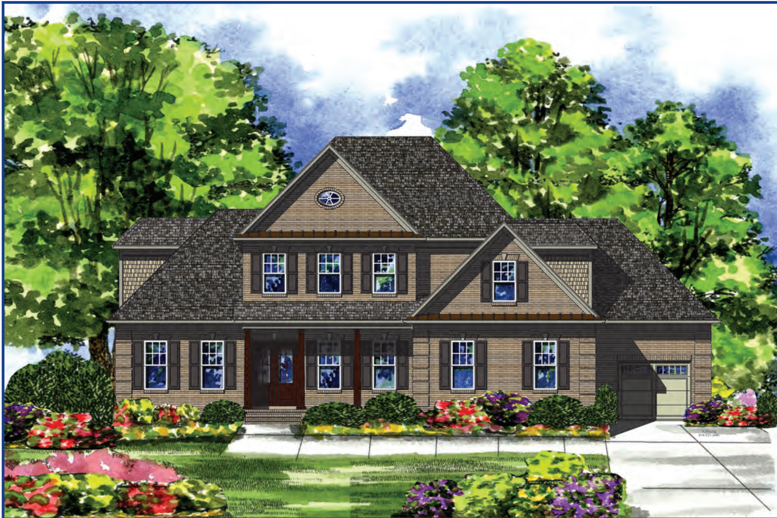
The Broadleaf III