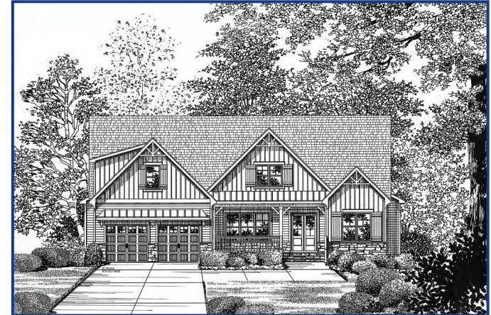
Front Load Elevation