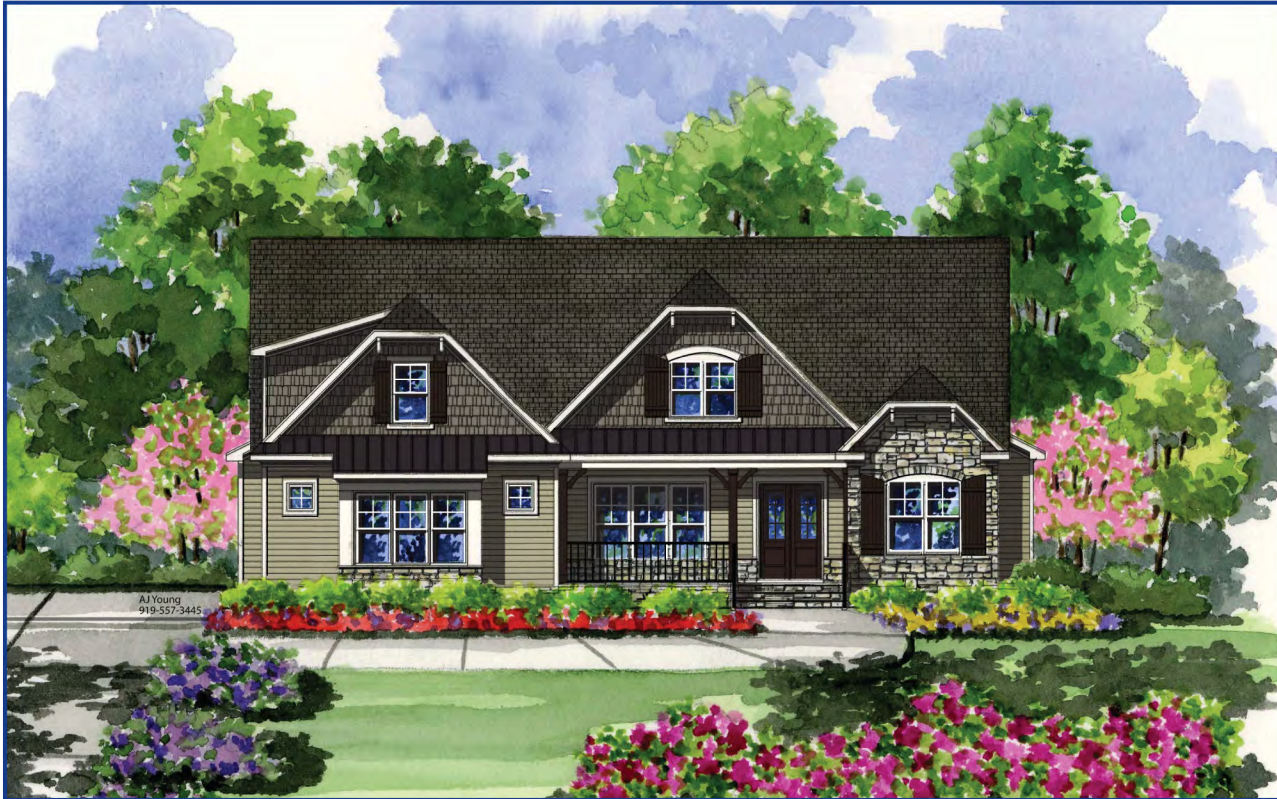
Side Load Elevation